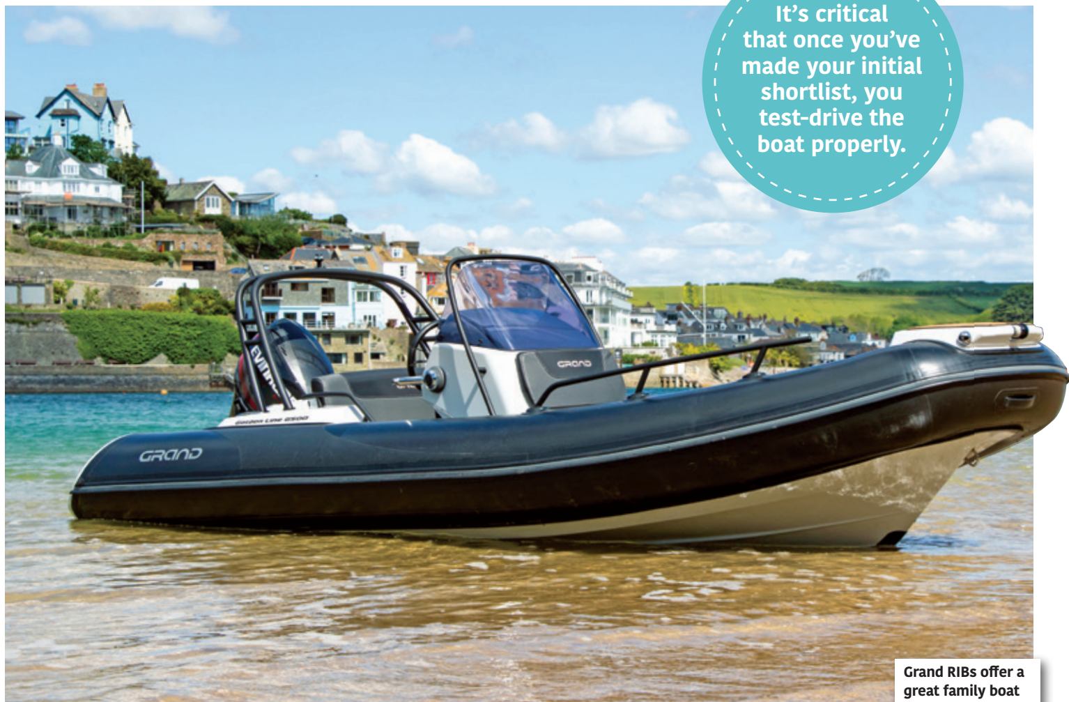
Grand RIBs offer a great family boat

It's critical that once you've made your initial shortlist, you test-drive the boat properly.