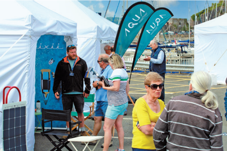
Above: The booths and exhibits shown above were typical of the land based displays at the Green Tech Show.